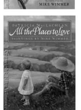
All the Places to Love